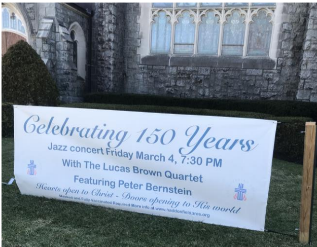
Jazz Concert Banner