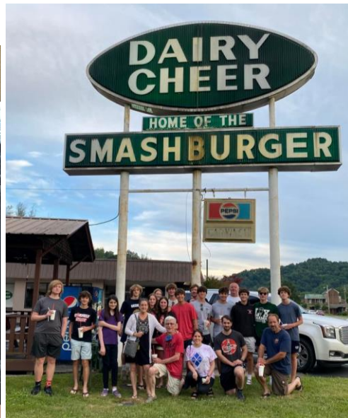
Youth Mission Trip to Kentucky