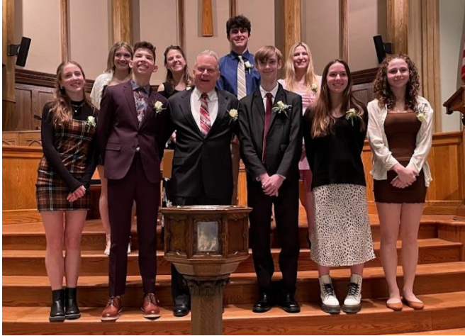
2022 Confirmation Class