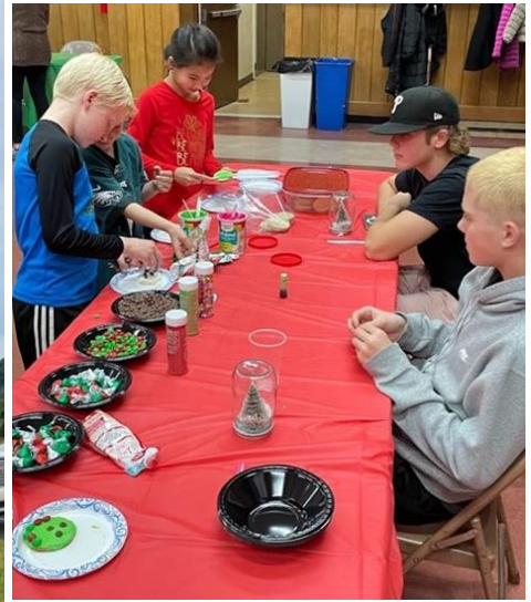
Advent Festival Crafts