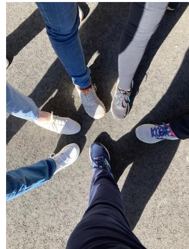
Made for walking – PW Walking Group Feet

There are three thriving Circles in PW working together as well as independently on mission and service projects of interest to each circle. Circle 1 were able to meet regularly again and made items to give to those who need a little extra care. They made child's knotted fleece blankets to distribute to single mother homes, walker totes and lap robes for nursing homes, and Serenity shawls. The circle has also started crocheting baby blankets. At the Interfaith Caregivers Holiday Fair, in December items were sold to help raise money for the missions PW supports. Circles 3 and 4 are actively involved in the Horizon's Bible Study as well as independent mission projects. In addition, a Walking Group was formed for the purpose of enjoying the outdoors and the company of one another as well as getting a little exercise. It has been a very welcome addition to our activities.