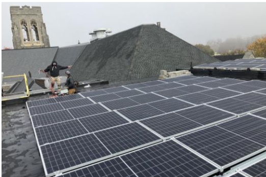
Solar Panel Installation