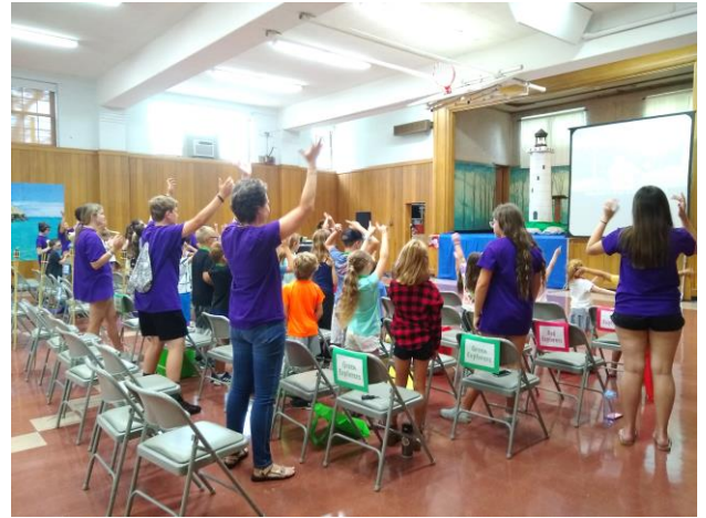
VBS 2022 – Closing Song

the Explorers. This is always one of the most busy, active, and FUN weeks of the year.