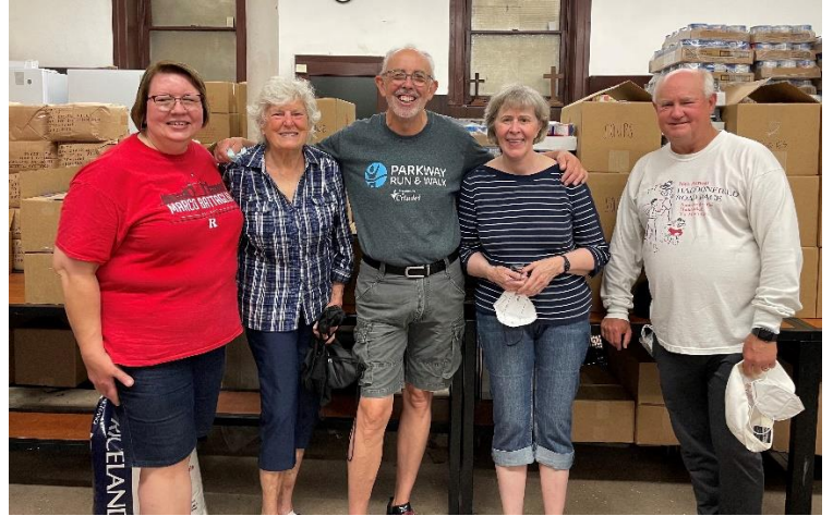
St. Wilfrid's Volunteers